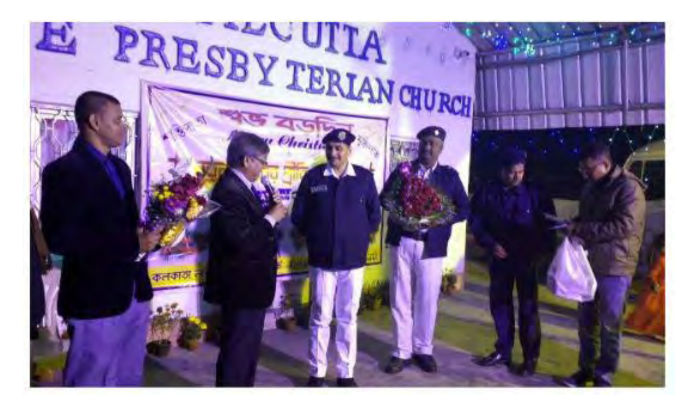
W.B Chief Minister sending regards through police officers