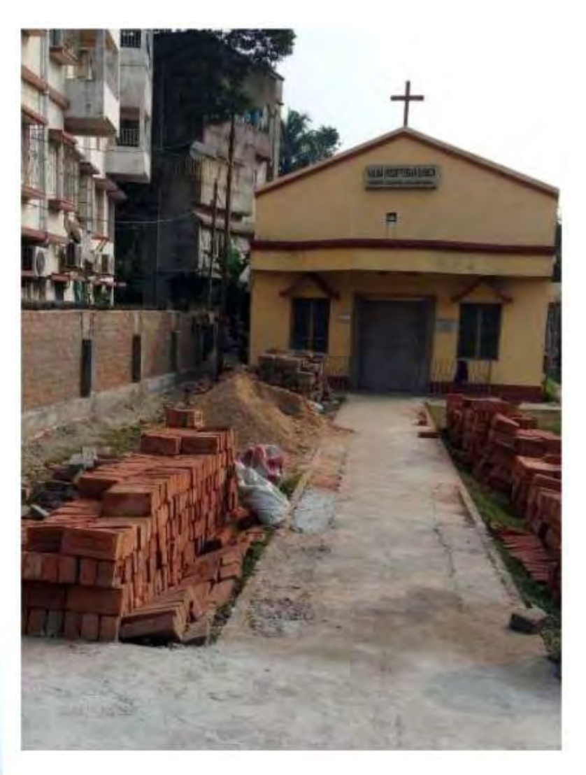
Haldia P. Church Boundary Complete