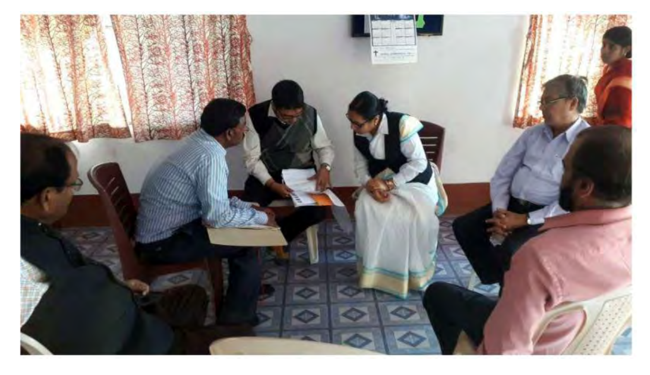
Consulting with advocate about Haldia Church boundary land