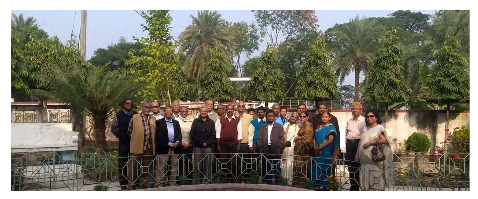
CMA Christmas get together