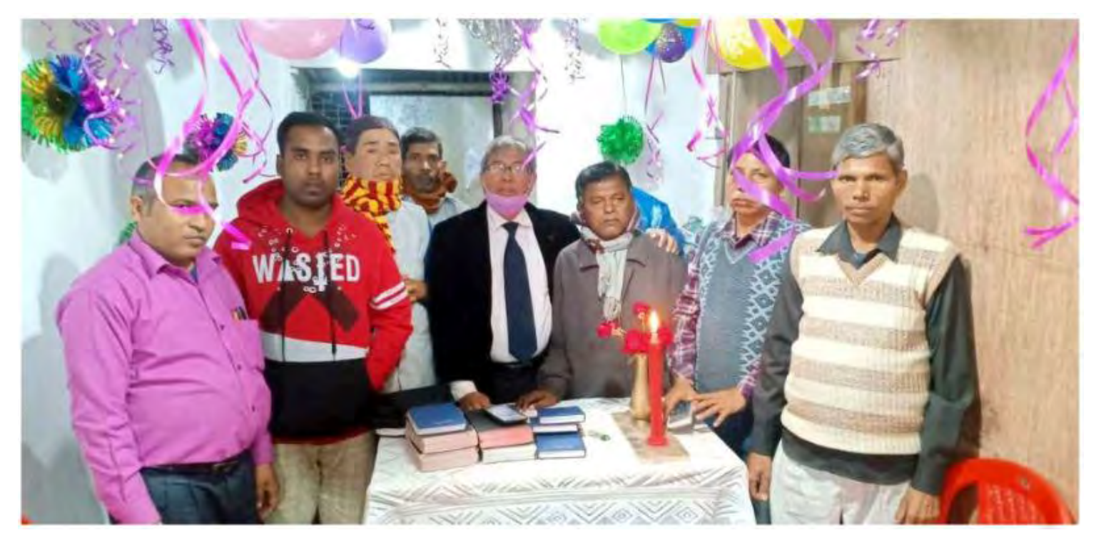
Inauguration of a believer's new restaurant