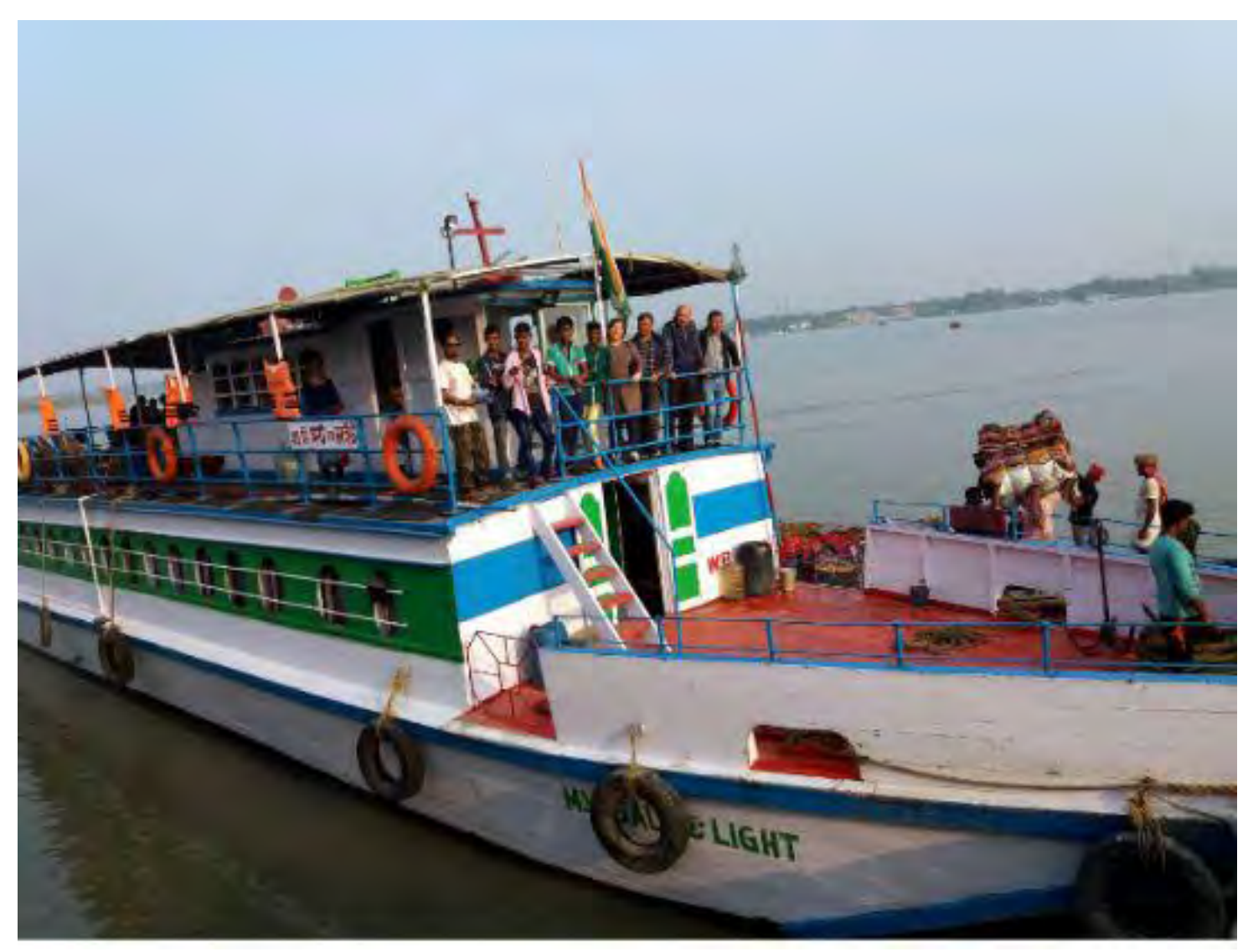
Salt & Light Boat for Outreach in the Sundarban Islands