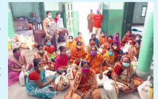
Ideal Mission School Yass Relief

Since last year from 23rd March till now we could not bring students or hold classes in our seven non-formal Kindergarten schools and one Primary School (Ideal Mission School) due to government restrictions for the pandemic. But our teachers routinely called parents and gave them home works to do on Mondays, Wednesdays and Fridays. This year we will not be not allowed to perform the Christmas Program due to governmental restriction for children. We are thankful to IDEA Mission & Shinil Church for their kind contribution so that we are able to distribute food package aid two times to the children's families this year.