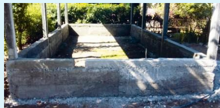
Dhawala Presbyterian Church