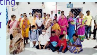
Four Days Fasting Prayer