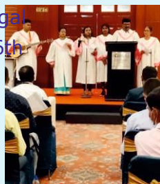
KLPC Choir at WBLDS