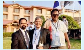
Mahisadal Presbyterian Church

Praying hard for a piece of Land for Mahisadal P C which cost us about US$2500/- .God may grant us the fund in His time.