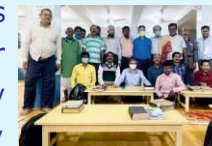
11th Kolkata Presbytery Meeting