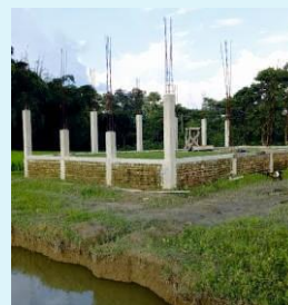
Parul Presbyterian Church Construction