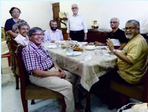
CMA Board Meeting at President's House

Thank you for your continuous love, prayer & support for CMA. Lord we pray that all our worker and partners be filled with the Holy Spirit and reach the unreached (I Chronicles 4: 10). May the Birth of Jesus Christ, Immanuel, The New Born King, The Lord of lords, fill your Heart with Everlasting Joy, Peace, Happiness and Justice.