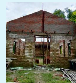
Shimolbari Presbyterian Church