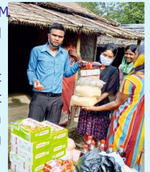
Covid-19 2nd Wave Relief

This caused a huge crisis as thousands of migrant daily wage workers from villages were suddenly out of work and had to return to their home town from their work place of different states, and were starving to death. Although our Central and State