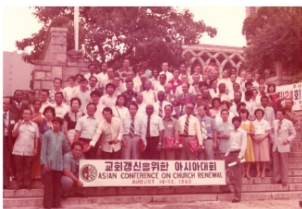
Asian Church Renewal Conf.Korea'82