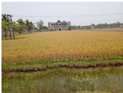
At Canning Campus Winter Cultivation