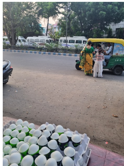
Easter Egg Distribution(Outreach)