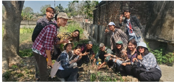
Thai Team Planting Mango Tree in Canning Campus