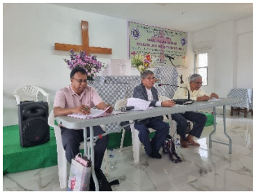
12th Kolkata Presbytery '24