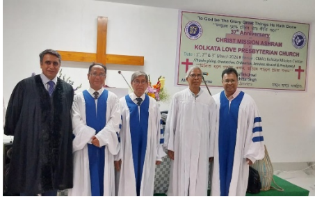
37 th Anniversary of CMA & KLRPC