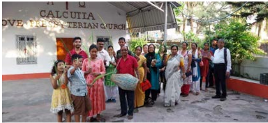
Palm Sunday Procession at KLRPC