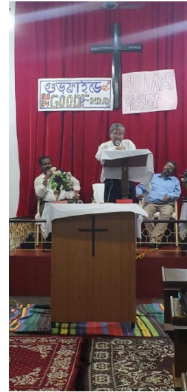
40 Days Fasting Hoogly Telegu Church