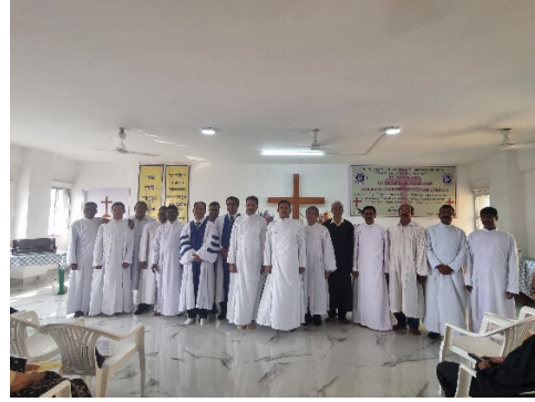
Kolkata Presbytery Pastors