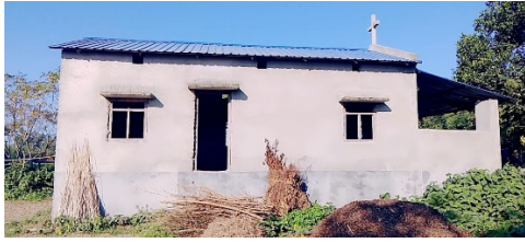
Church at Andowakhola in Bihar