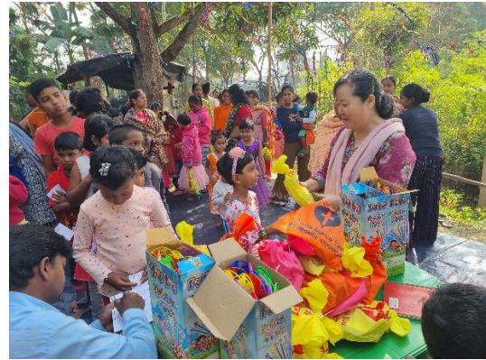
Christmas Gifts to Daughter Church '23