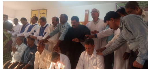
Elder & Deacon Ordination at 37 th Anniversary