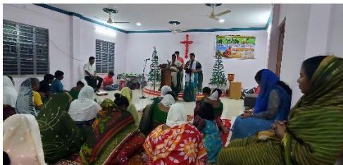
Sunday Worship at Champahati P C