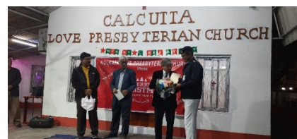
Christmas Greetings from Mamata Banerjee