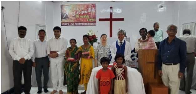
EASTER BAPTISM AT KLRPC on 31 st March 2025