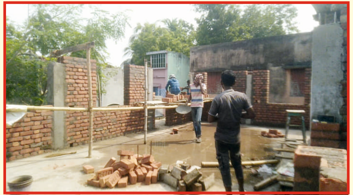
Islampur P C Construction 1