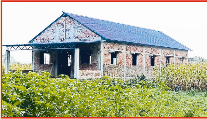
Thus Far the Lord Has Helped us to Build Parul Church