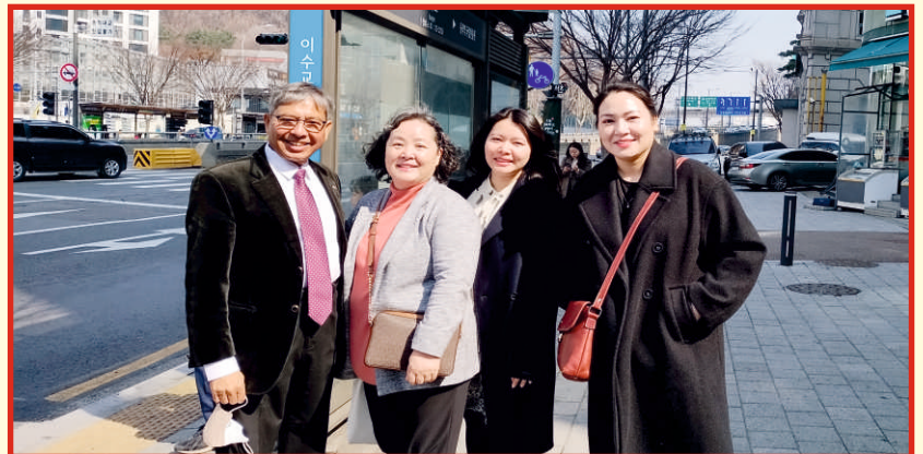
Family in Korea