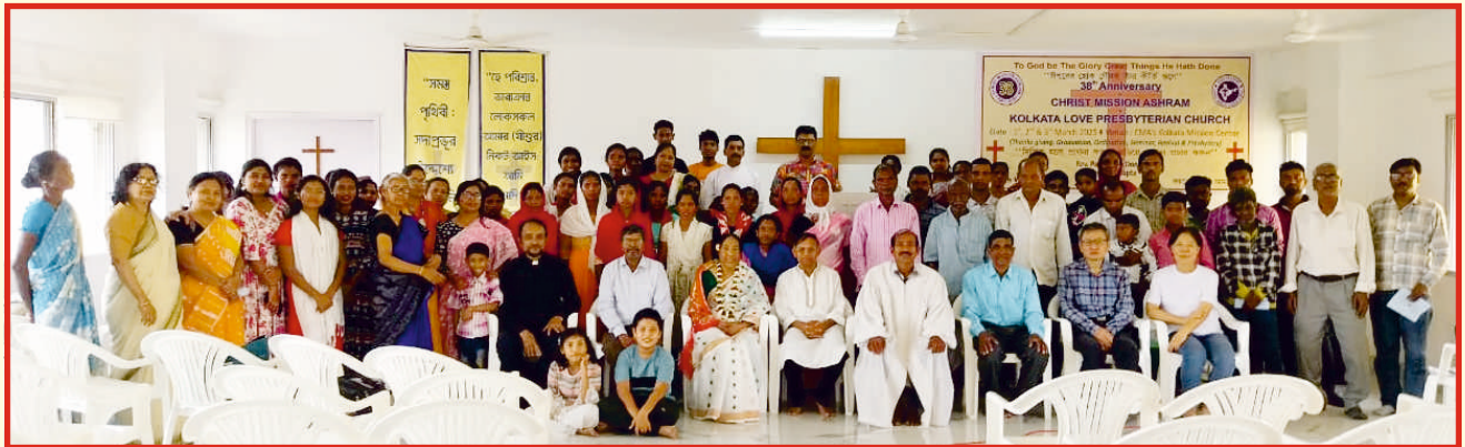
38th Thanksgiving Service of CMA+KLPC 1st March 2025