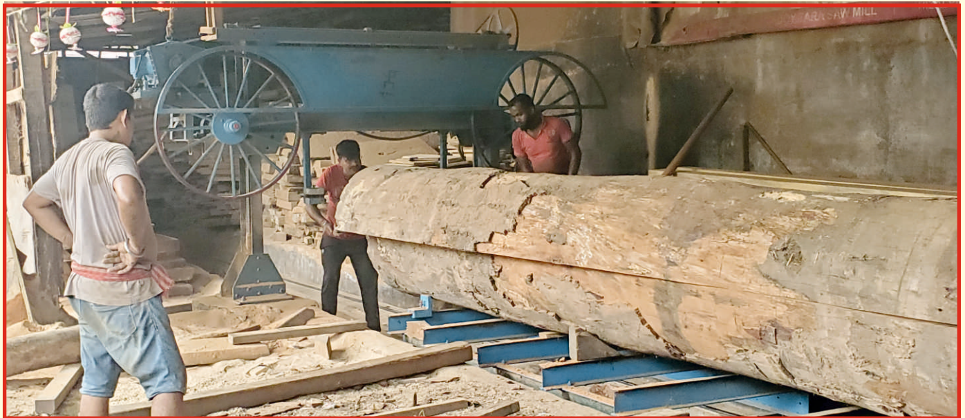
Log Purchased for Eternal Life Boat