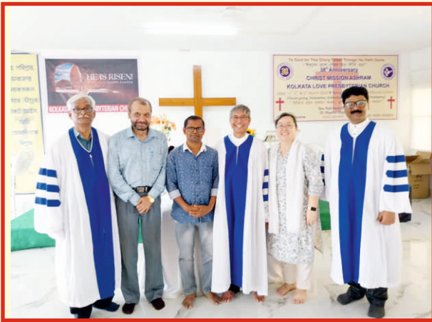
Easter One Brother Took Baptism